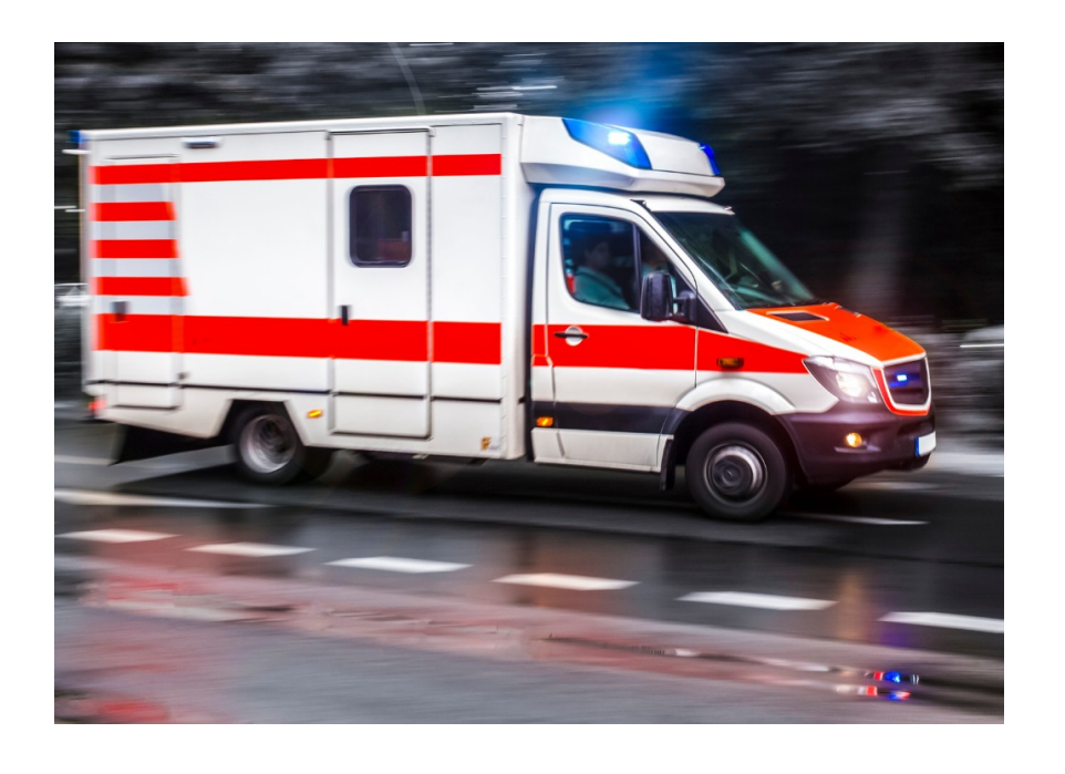
The ambulance came to the school.