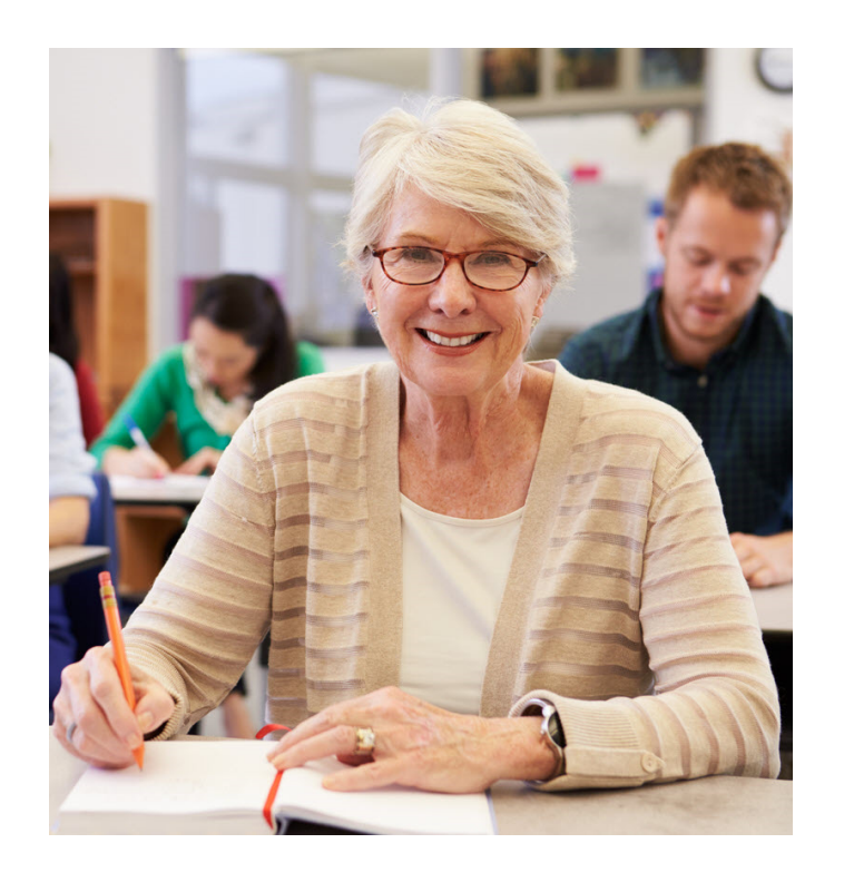
She is feeling better now.