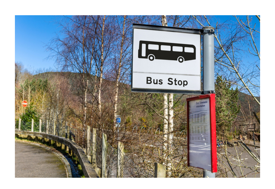
He needs to be close to the bus.