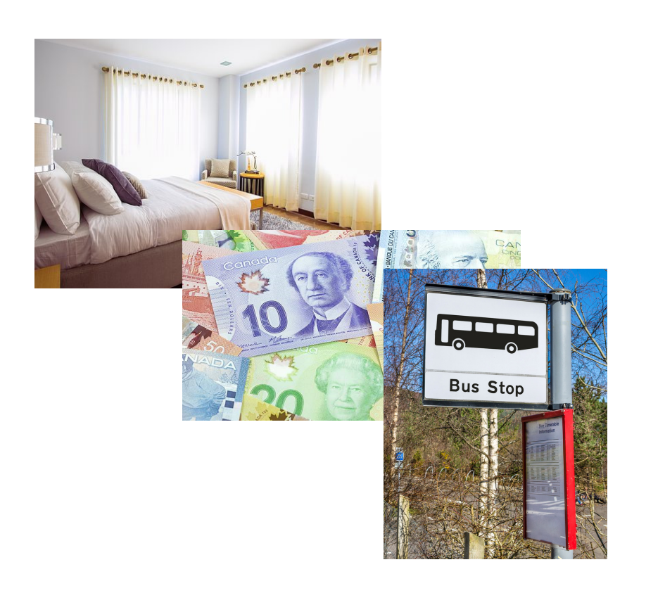
How many bedrooms? How much is the rent? Is it close to the bus?